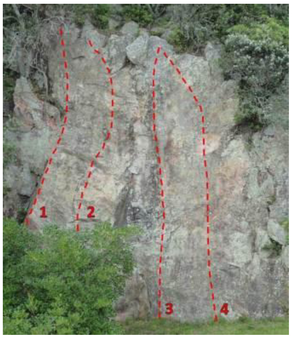
Figure 1: Fishermans Wall