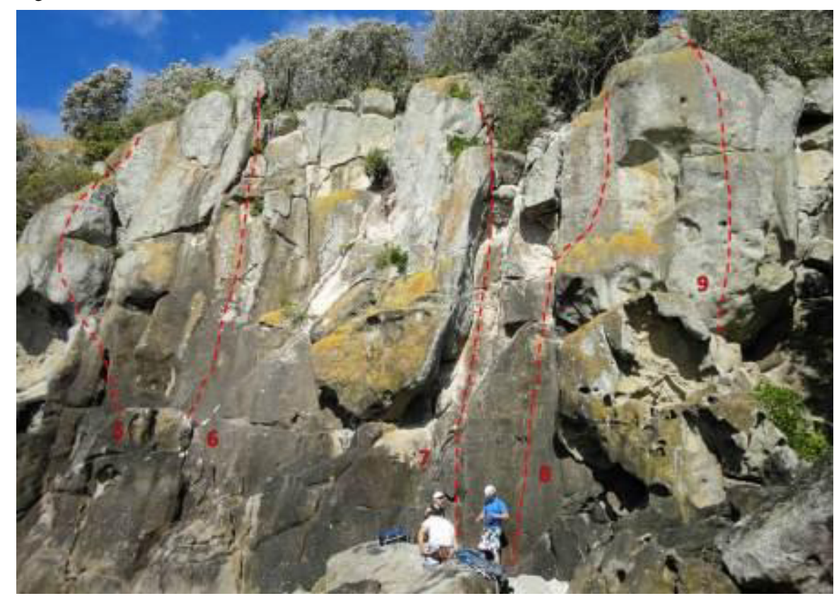
www.freeclimb.co.nz. Number One, for up to date Rocking Climbing Information.